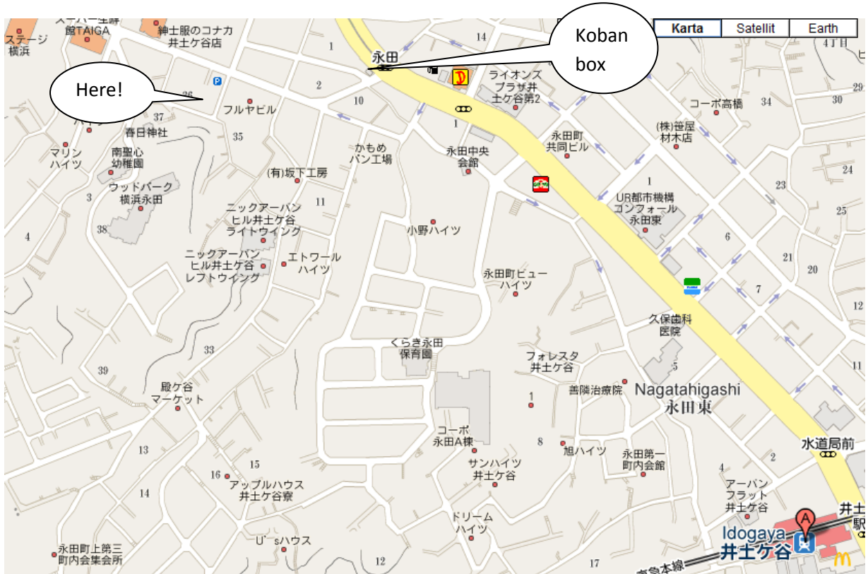
(A) = Idogaya Eki on Keikyū Line (5 stops from Yokohama).